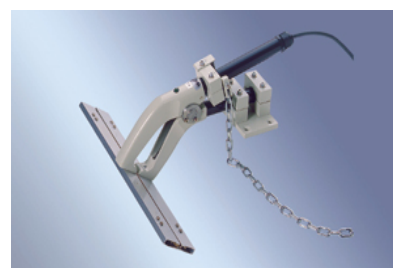
Table - top clamp