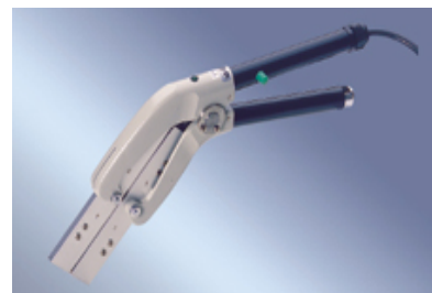
Beak - Types 150 + 250 DS