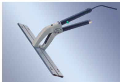
SFZ - Types 300 + 400