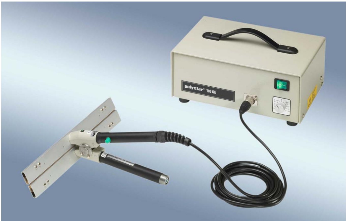
Impulse generator 110 GE with sealing-tong 300 D