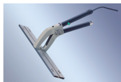
SFZ - Types 300 + 400