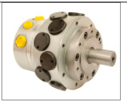
Spotface connection or optional mounting flange connection