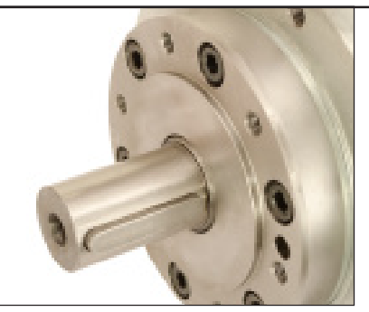
Key shaft, spline shaft or special shaft design on request