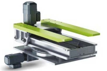
(Rotating) pushing forks