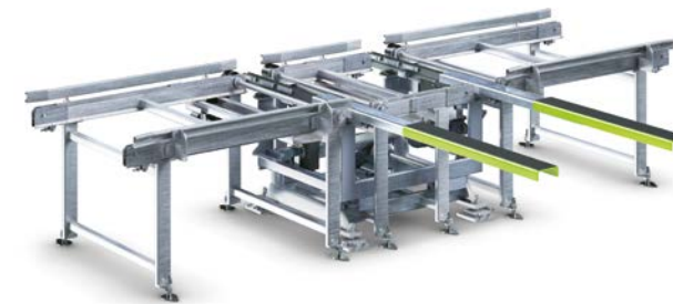
Eccentric lifting devices