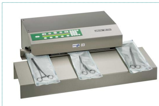
981 DSM with table