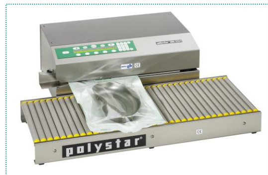
981 DSM with roller conveyor

www.polystar-hamburg.de eMail: info@polystar-hamburg.de