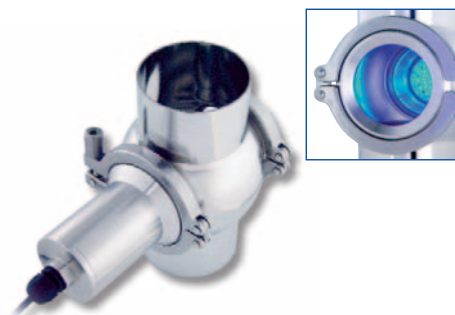
Inline housing with LED sight glass illumination

Finally, Kieselmann offers the following components: